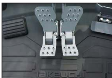
Foldable Travel Pedal (optional)