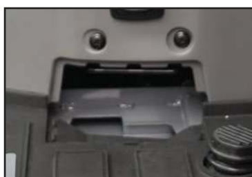
Drain on the Floor